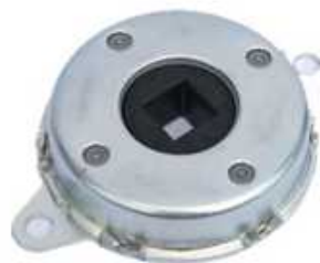
Rotary damper 1