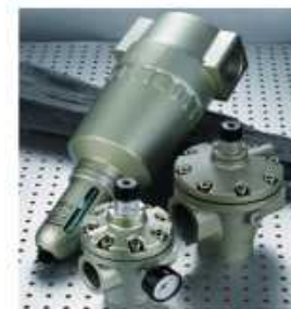
Bing Flow FRL