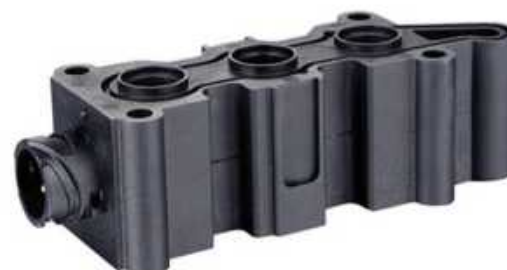
Solenoid Coil 3