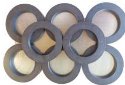
Cylinder Magnetic Ring