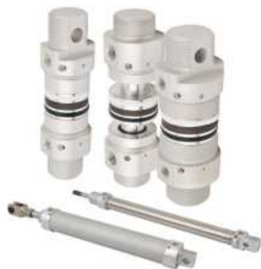
Mini Cylinder Kits