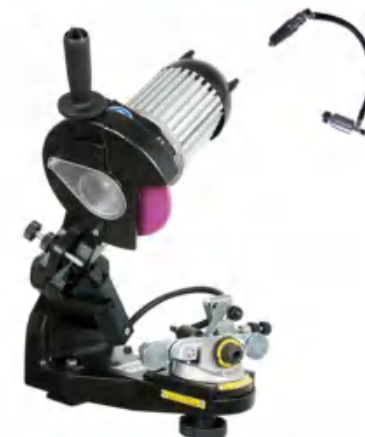
Hydraulic Clamp for Chainsaw Sharpener