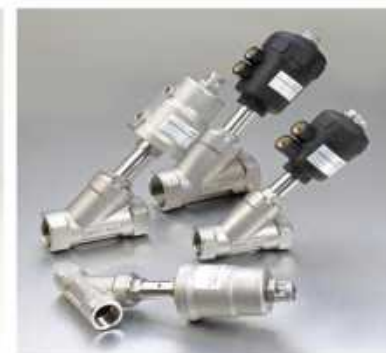
Angle Seat Valve