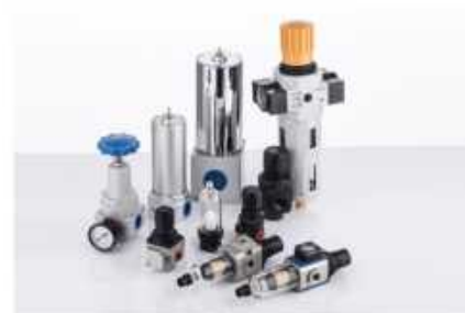
Air Line Equipment