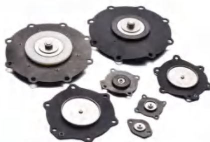
Diaphragm for Pulse Valve