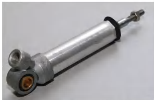
Pneumatic Cylinder For Truck