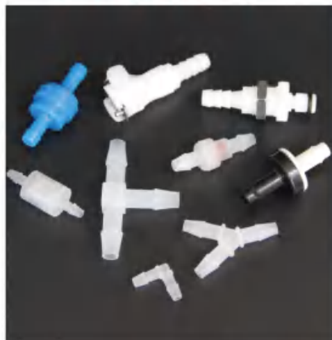
Medical Pipe Fittings