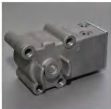
Pneumatic Valve For Truck