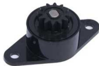
Rotary damper 2