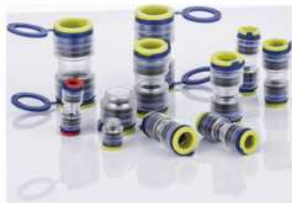
Optic Fiber Connector