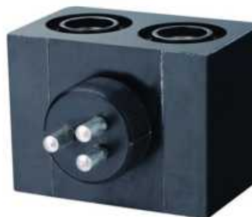
Solenoid Coil 1