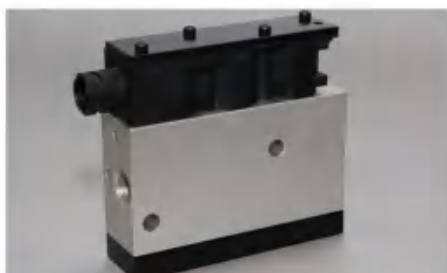
VOLVO 3944716 Solenoid Valve