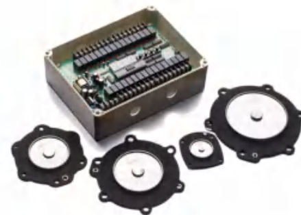
Diaphragm for Pulse Valve