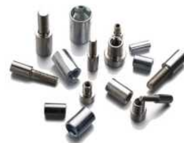
Cylinder Mounting Bolts