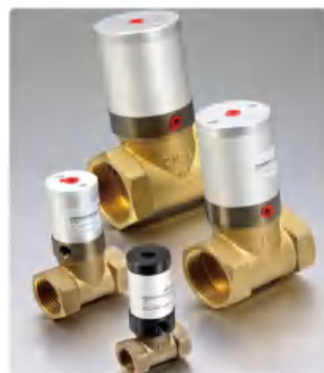
Pneumatic Piston Valve