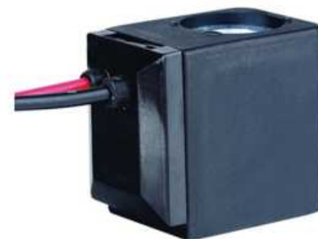
Solenoid Coil 2