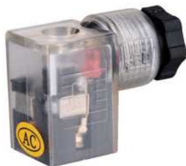
DIN43650A, B, C Connector