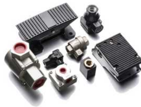
Quick Exhaust and Foot Valve