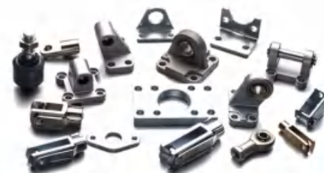
Cylinder Mounting Clevis