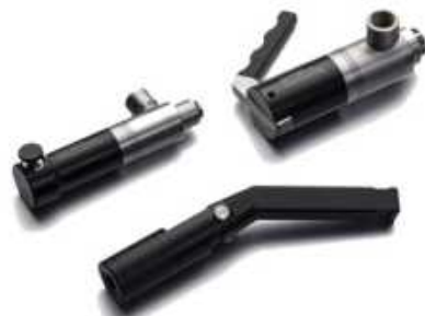
Fast Testing Tool