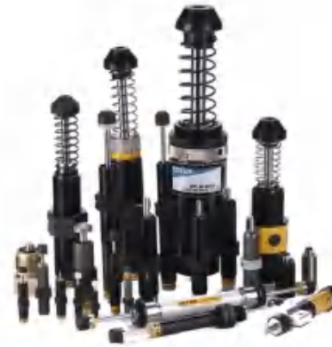
Industrial Shock Absorber