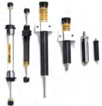
Hydraulic Speed Controller