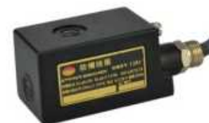
Solenoid Coil 4