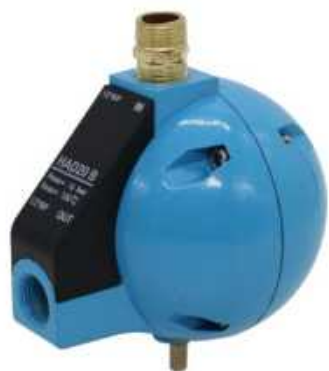
Ball Type Auto Drain