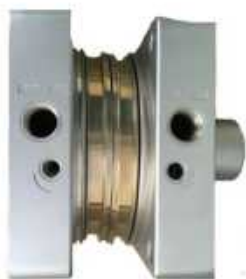
Bing Bore Cylinder Kits