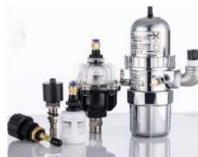
Auto Drain Valve