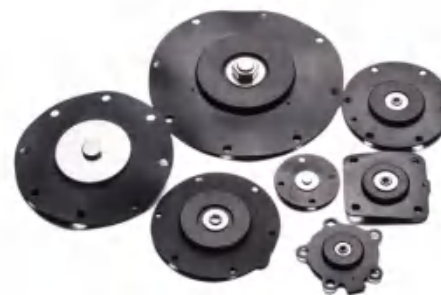
Diaphragm for Pulse Valve