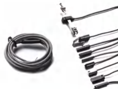
Cylinder Sensor (Reed Switch)