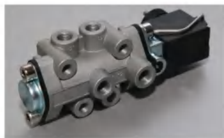
SCANIA 1423566 Solenoid Valve